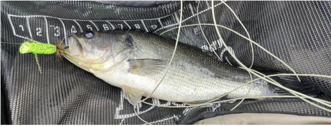
Fished the Silver Fork of the American. Beautiful stream. Caught a few fish mostly on dry flies.