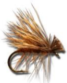
Elk Hair (nope)

The Hat Creek Caddis sampler..... (for this day, anyway)