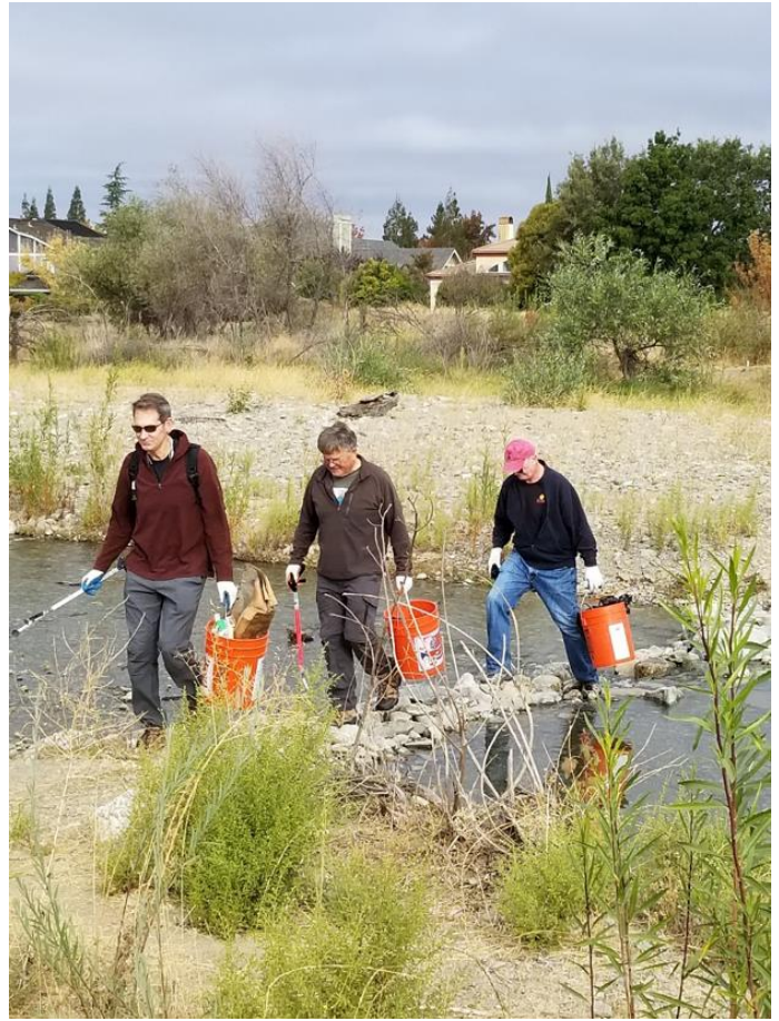
Crossing the creek