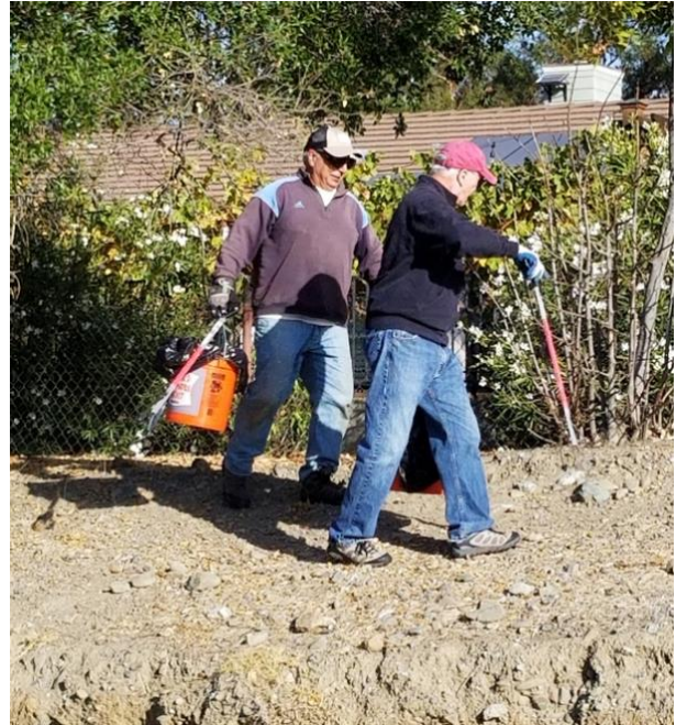
Oh look! Get that cigarette butt!