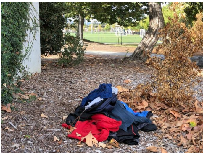
Homeless encampment #2 near the soccer fields