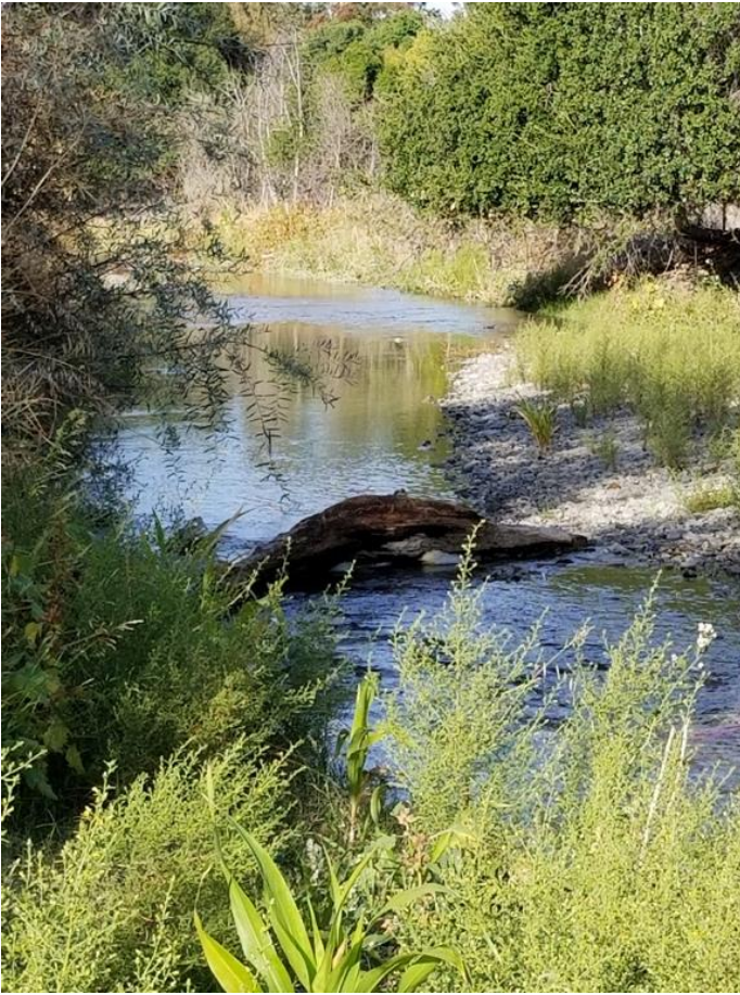
The beauty of the creek