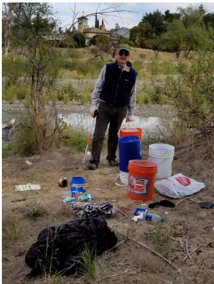
Homeless encampment #1