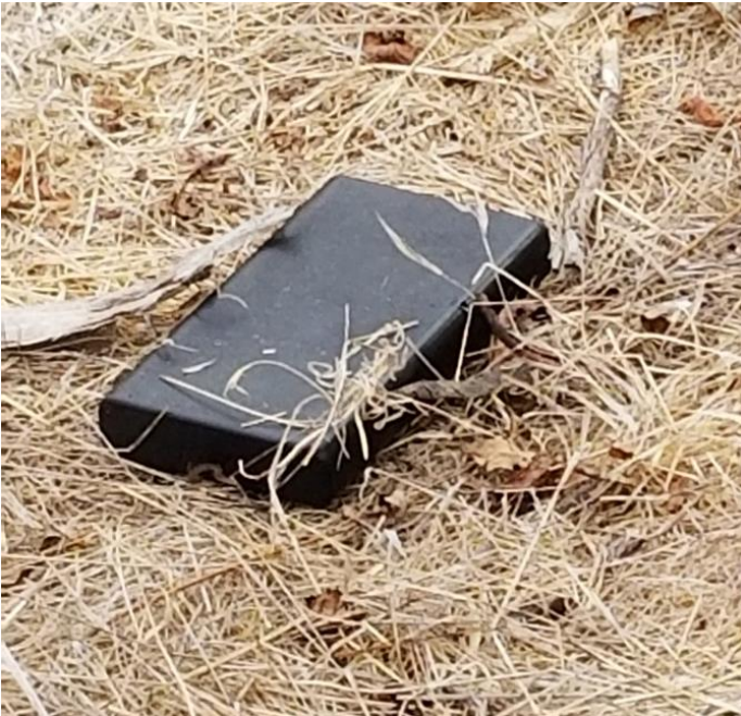
Battery pack to recharge cell phones