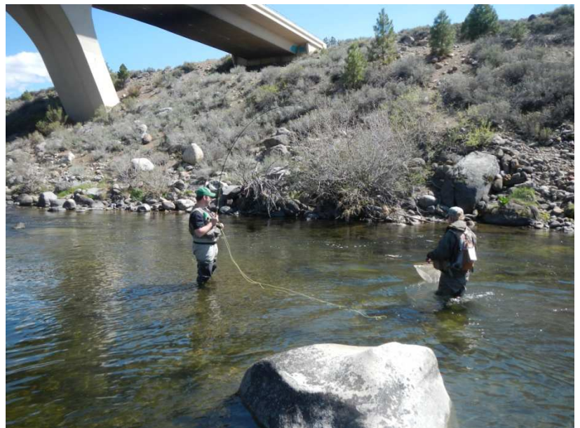
Dan Vargas hooked up with a Truckee River Rainbow in 2015

Currently, there are only 2 sign-ups, and I encourage members to make this a full outing and take advantage of Matt's expertise.