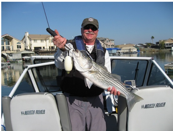
10 pound Delta striper from 2012. These fish are great fun on a fly rod.

We will provide more information as we get closer to the outing and we can get more specific as the stripers keep move in, which usually starts around mid to late October. It is looking like a good season this year with lots of early stripers being caught out in the Western Delta!