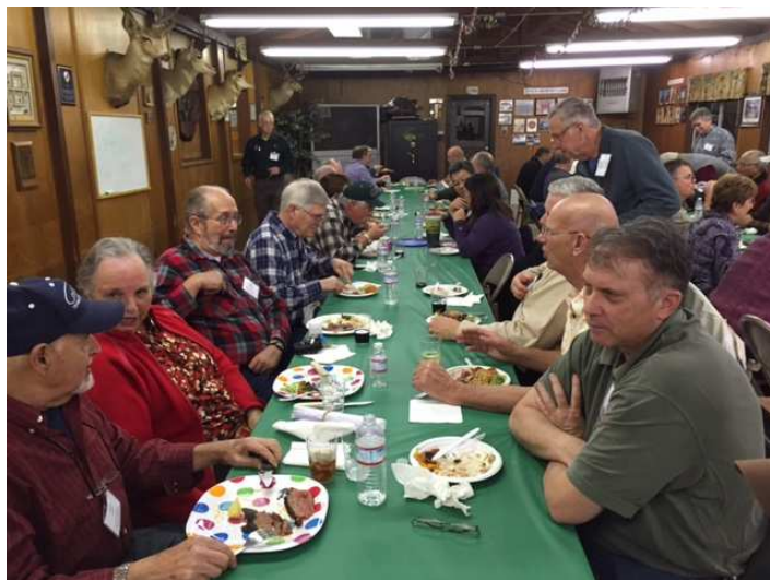
Annual installation dinner meeting banquet