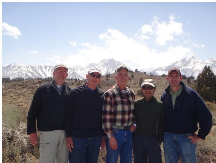
The gang of five

Flows on the East Walker were very low (50 cfs) which made a bit like “shooting fish in a barrel”. Most of the time we were sight casting to fish with two-nymph rigs. Once again, the tight-line technique worked well. Most fish were caught on small baetis or red midge patterns. A few were caught with white streamers. Plenty of rainbows, browns and a few white fish were brought to net by all with the biggest in the 19/20 inch range. It is not often that one can fish site fish to large pods of fish all within talking distance of each other – which made this a fun, interactive, group fishing activity.