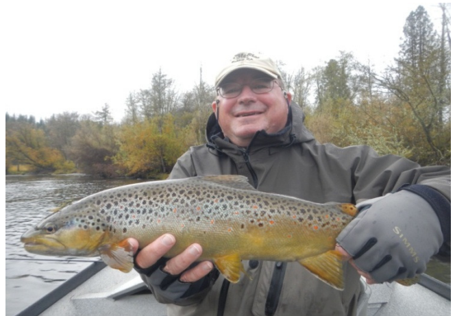
Sea-run brown caught below rush creek on the morning of Nov. 17 th .