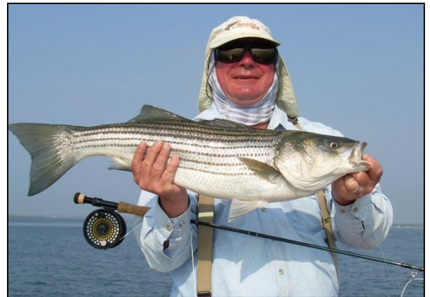
The author with a Shinnecock Bay striped bass

I've been bonefishing before, and found flats fishing for striped bass remarkably similar. Capt. Brewster spotted the quarry well before an inexperienced client like myself, gave me the range and direction, and told me when to cast. As your fly settles into the water, Instead of twitching it, you tuck your fly rod under your arm and begin stripping vigorously. With a well-aimed cast, this often results in a strike. However, you must continue stripping your fly until the striped bass is soundly hooked. If you think of a bonefish as a thoroughbred, then a striped bass is more like a Clydesdale. It does not run as fast, but it is much stronger! I wore my arm out reeling in a 20 pounder while Capt. Brewster was urging me on to greater efforts so that I could cast to the other schools of striped bass coming toward us across the Shinnecock flats. All-in-all, one of my best fishing weekends ever!