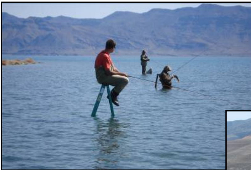
"The Line" May 2009